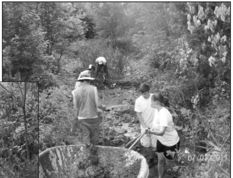
Route 32 Plunge Pool - After (hauled away 4 yards of sediment)