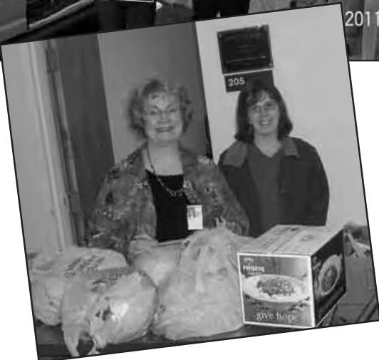
A few of the loyal Food Pantry volunteers!

During 2011 the V.F.S.P. provided and coordinated the following: