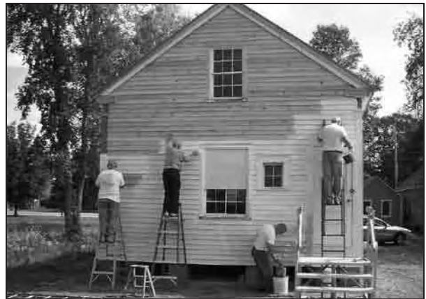
Annex repair day.