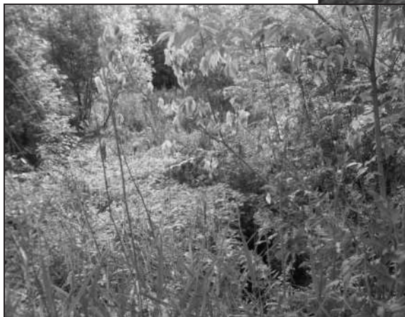
Route 32 Plunge Pool - Before