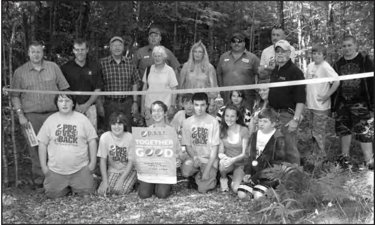
REACH students celebrate grand opening of school trail.

Vassalboro Community School has enjoyed another year of tremendous support from the community, parents and students. The successful completion of our mission statement and work with children would not be possible without the thousands of volunteer hours offered by the very talented and thoughtful people of this community. Thank you again for another year of working together for the benefit of our children.