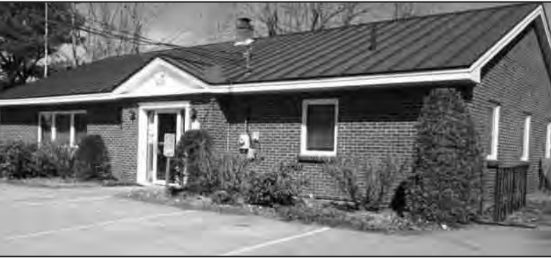
Vassalboro Public Library, in March of 2012