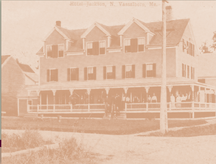
Hotel Jackson, N. Vassalboro, Me.