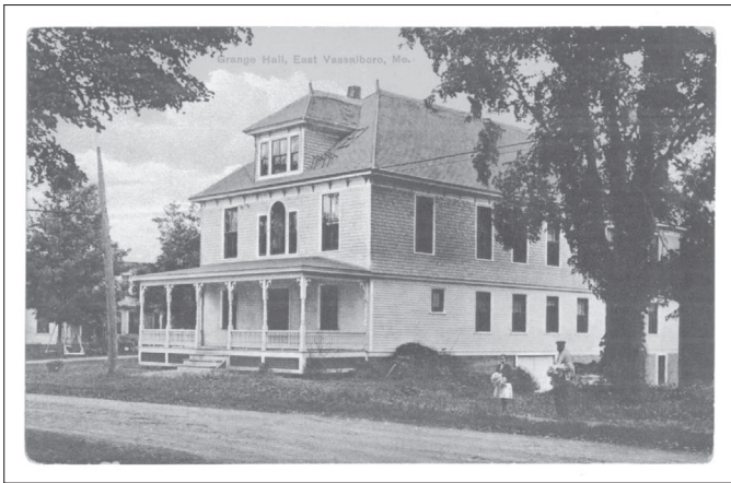
Grange Hall, East Vassalboro

This year brought continued activity dealing with new and old subdivisions. Three new subdivisions were approved: On Route 201, four lots in Riverside Heights, on the south end of the Church Hill Rd, five lots with duplexes on the lots, and on the Stone Road, 12 lots were approved. We also re examined three approved subdivisions for amendments. One needed an amendment for a change in road construction, another wanted to add a lot, and the last wanted to add four lots. The first two were approved, the last was not due to issues with road construction.