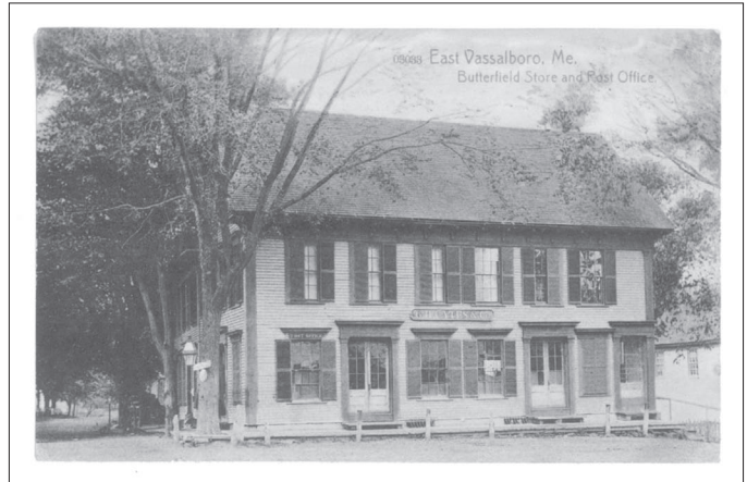
Butterfield Store and Post Office, East Vassalboro

Region Lakes Alliance – conservation assistance and shore line property maintenance. Also, this past year we have had Boat Launch monitors in place – paid for by our Association – to help insure that no evasive