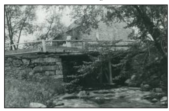
Grist Mill, at the Bridge over Seawards Mills Stream, Vassalboro, 1900. Copied from an original in the possession of Freeman Butler, Cross Hill Road. Collection of Vassalboro Historical Society 74.18.1

Due to seasonal high water flows and the drop in elevation (head), this location was an ideal site for water powered mills. During the late 18th and 19th centuries there was a grist mill over Seawards Mills Stream at Cross Hill Road, excelsior* and saw mills on the north side of the stream, and a hub mill on the south side. *manufactured wood shavings for furniture