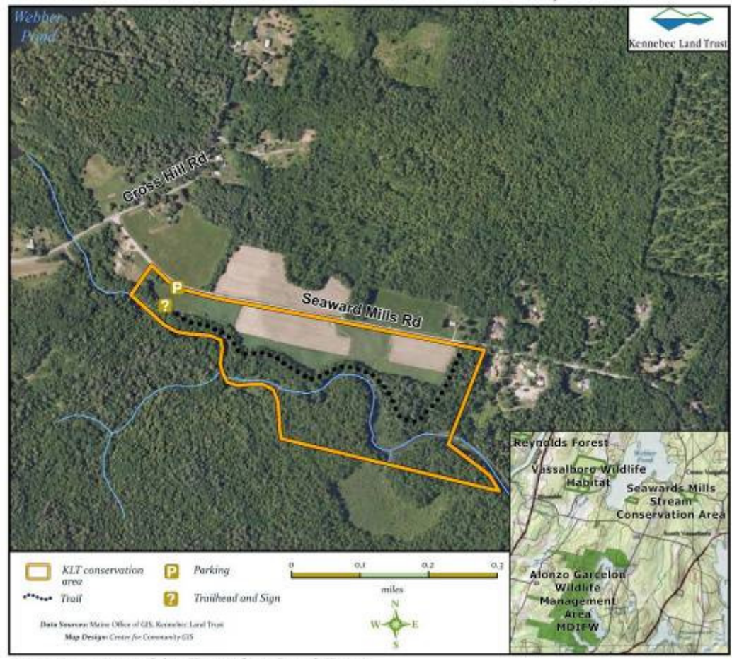
44 acres - owned by Kennebec Land Trust

Public uses: This KLT property is open to the public for hiking, nature observation, cross-country skiing, hunting, and other low impact non-motorized recreation. No ATV's are permitted . The agricultural fields are leased to a neighboring farmer. <u>Please do not walk through the farm fields or park in field entrances.</u>