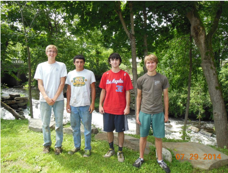
Figure 4 - After brush clearing at the Box Mill dam site on the Outlet Stream by YCC (see background on opposite side of stream). CRLA YCC devoted 110 man-hours onsite in preparation for nature like fishway.