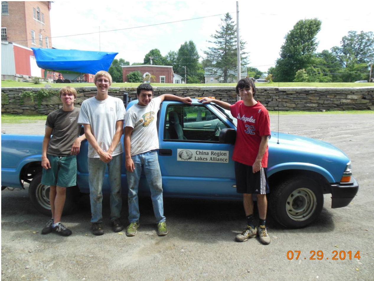
Figure 2 - CRLA YCC crew packing up the truck at the Box Mill dam site on the Outlet Stream.

Our Mission: To protect and improve the water quality in China Lake, Three Cornered Pond, Three Mile Pond and Webber Pond, and to benefit our local economy through Integrated Watershed Management.